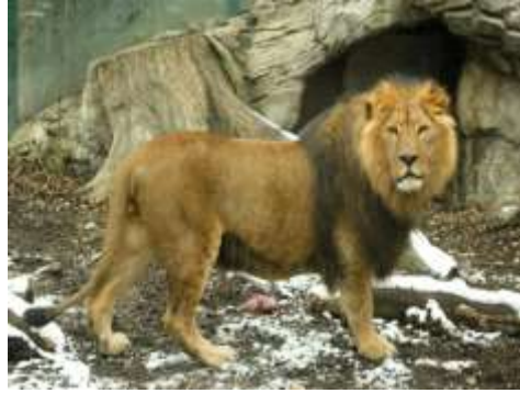
A lion lives in a den