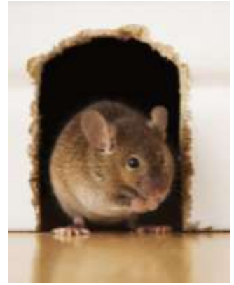
A rat lives in a hole