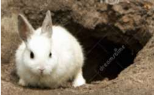
A rabbit lives in a burrow