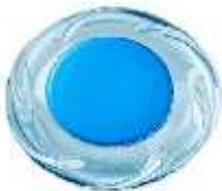
a) A water bottle