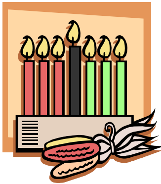
a) A candle